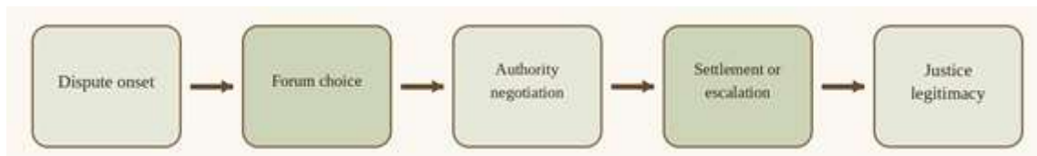
Figure 1. Author-generated causal pathway for layered legality.

authorised form and selective practice—is the central theoretical hinge of the article ( Leonardi, 2013 ); ( Ortiz et al., 2015 ).