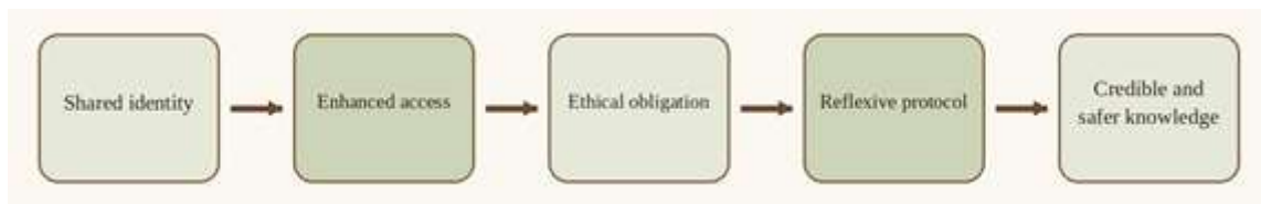
Figure 1. Author-generated causal pathway for situated insider ethics.

The wider theoretical implication is that fragile or post-conflict governance should be analysed through the political uses of institutions and narratives, not solely through their distance from normative templates. This is where the South Sudan material becomes especially revealing. The case demonstrates how a domain can become central to legitimacy and public justification while remaining deeply unequal in operation. That tension—between authorised form and selective practice—is the central theoretical hinge of the article ( (Agee, 2009) ; (Author, 2009) ).