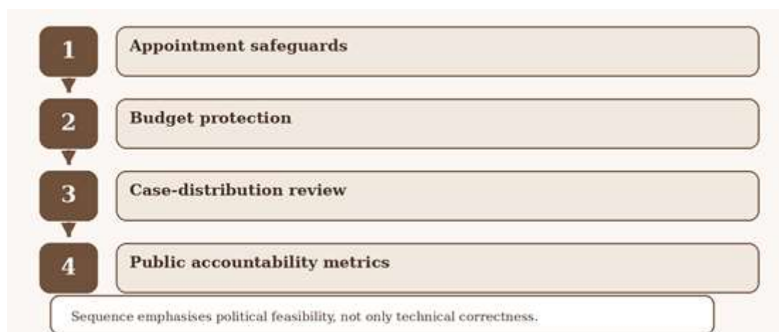
Figure 3. Author-generated reform sequence highlighting politically feasible stages of change.

Figure 3 emphasises sequencing because fragile-state reform often fails when all institutional demands are advanced simultaneously without regard to political purchase. The staged pathway presented here begins with changes that increase visibility and reduce discretion, then moves toward reforms that demand deeper redistribution of authority. This sequence is analytically important because it recognises that politically feasible reform is usually incremental even when the underlying problem is structural ( (Tushnet, 2013) ; (Lin et al., 2016) ) ( (Hoepner et al., 2023) ; (Fox & Hallock, 2024) ).