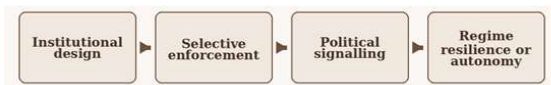
Figure 1. Author-generated causal pathway for selective accountability.

Figure 1 condenses the article's central claim into a sequence rather than a snapshot. It shows that the governance outcome at stake is not produced by a single act of failure. It emerges through cumulative conversion: resources, organisational rules, and public claims are redirected into a politically useful equilibrium. This sequence matters because it clarifies why episodic reform efforts often strike the visible effects of the problem while leaving its reproduction mechanisms intact ( (Simon, 1991) ; (Barca et al., 2012) ) ( (Tushnet, 2013) ; (Lin et al., 2016) ).